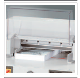
The electronically secured